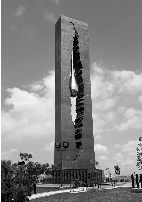
The “Tear Drop” 9/11 Memorial “To the Struggle Against World Terrorism” in Bayonne, NJ, donated to the U.S. by Russia.