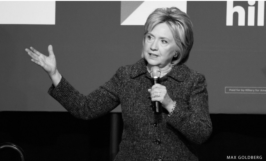
Hillary Clinton: lousy stooge for wars and Wall Street