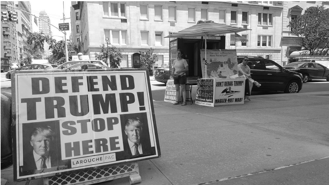
LaRouchePAC organizing in Manhattan, defending the U.S. Presidency and supporting the United States joining the economic outlook of China's Belt and Road Initiative.

But let me just say, in parentheses, that this very positive attitude of President Trump towards China, and towards Russia, actually, is the real reason for the currently attempted color revolution against President Trump. It is because Trump is about to improve the relationship with Russia and China, qualitatively, way beyond anything in the past. In response, the political forces representing the old paradigm—those people who thought, that when the Soviet Union had collapsed, that they would build a unipolar world and keep Russia down, prevent the rise of China—it is they, who have started what President Trump has called