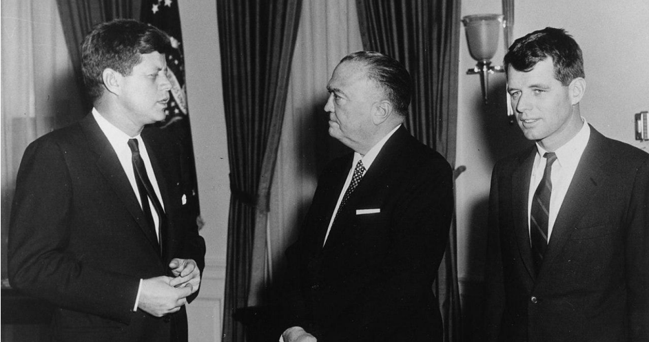
President Kennedy, J. Edgar Hoover, and Robert F. Kennedy in the White House Oval Office, February 23, 1961.

15. On March 1, 2017, the New York Times revealed that Obama and his national security colleagues had spent the months after the election and prior to President Trump’s inauguration dropping a trail of “leads” in official documents and leaking information, in the effort to de-legitimize Trump and to continue their policies against Russia and China.