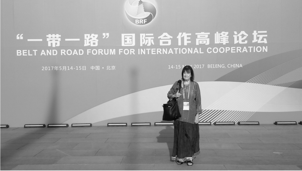
Helga Zepp-LaRouche at China's Belt and Road Forum in Beijing, May 14-15, 2017.