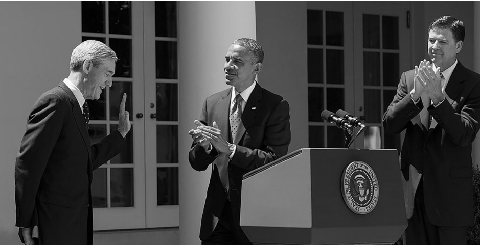
Former FBI Directors Robert Mueller and James Comey join Obama in the Rose Garden of the White House, June 21, 2013.

The way is clear for the President to win. The population must mobilize, as LaRouche said, and tell their senators and congressmen to cut it out, stop the coup, and jail its perpetrators before this great country is destroyed. Under our Constitution, the people have the unique capability to stop a coup, by kicking their senators and representatives in the ass, and not accepting “no” for an answer. Tell your congressman and the President to join the One Belt, One Road project and implement LaRouche’s Four Laws for recovery of the United States. Show the population this great vision for the future as Franklin Roosevelt once did; mobilize the population directly for this program and tell Republican and Democratic Wall Street pawns, whether they are spouting Von Hayek and Milton Friedman or John Maynard Keynes, to get out of the way. The Gods of Olympus may scream and yell and attempt to hurl lightning bolts, but, as a result of the economic revival now underway in the Pacific and Eurasia, the ground under Mount Olympus is rapidly giving way. The would-be emperors have shown us that they have no clothes, and that they are really quite insane. They now can be ridiculed, mocked, and laughed at, something everyone should do daily. As Martin Luther King so eloquently noted, economic and social progress are the true measures of any society—the true mandate of Heaven. That reality is on our side.