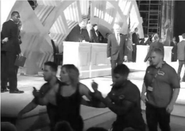
A protestor lead away from the Central Park production of Julius Caesar. She had called out the production as “inciting terrorists.”

Lyndon LaRouche’s idea of the republic, cited above, runs directly counter to the modern idea of tragedy, drama, and art in general. The United States is, thankfully, not a democracy. It is a Hamiltonian republic, with a Hamiltonian Presidency. And the comprehension of Classical tragedy will be the way out for the American people, caus-