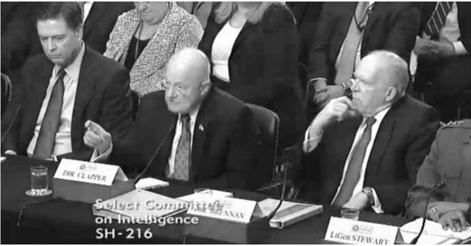
Fired FBI Director James Comey (left), Former DNI head James Clapper (center) and former CIA director John Brennan (right).

10. In October and November, 2016, a new escalation of he Trump/Putin demonization campaign began.