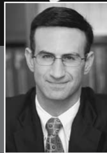
Congressional Budget Office